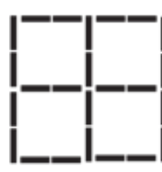
Four squares 4m (w) x 4m (h)