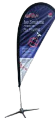
No Smoking means No Vaping

Display these banner at school events to remind everyone of the smoke-and vape-free laws.