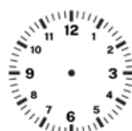
Clock 2.2m (w) x 2.2m (h)