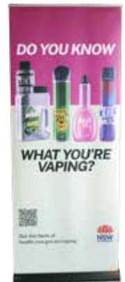
Do You Know What You're Vaping?