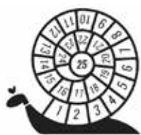
Snail hopstotch 1.79m (w) x 1.7m (h)

Give your playground an active facelift with these stencils.