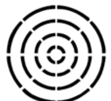
Target 1.8m (w) x 1.8m (h)