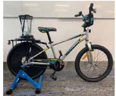
Kids (up to 50kg rider weight)