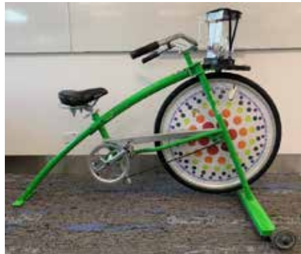
Adult (up to 100kg rider weight)

Blender Bikes are a perfect blend of fun, fitness, nourishment, and sustainability. We have an adult and a kids Blender Bike available to borrow and “mix up” your next event.